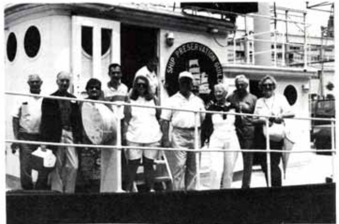
NJ Chapter members at Barnegat Lightship