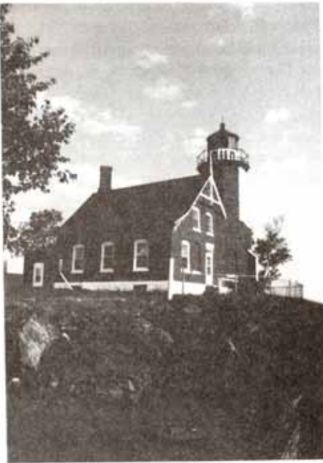
Eagle Harbor Lighthouse

The first lighthouse at Eagle Harbor was completed in 1851 at a cost of $4,000. By 1868, the lighthouse had fallen into a disreputable state and Congress appropriated $14,000 for its replacement. The octagonal tower is ten feet in diameter and measures 44 feet from base to the top of the ventilator ball. Once equipped with a Fresnel lens, it now is equipped with a rotating aero-beacon.