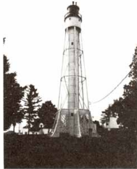
Sturgeon Bay Lighthouse

This metal tower was constructed in 1899 by John P. McGuire of Cleveland, Ohio. The design was an experiment in lighthouse design which failed because the architects did not consider the fierce winds that are prevalent in the area. In 1903 the structure was almost completely rebuilt. The original tower, which was 8 feet in diameter and supported the whole structure, was converted to a cylindrical stair tower that supported only the stairs. A new skeletal framework was constructed to support the tower, with larger buttresses anchored to a foundation which was expanded from 25 to 36 feet. The old watch room and light crown were added on top the new tower which increased its height from 78 to 98 feet. It is equipped with a 3rd order Fresnel lens built by Henri LePaute of Paris, France.