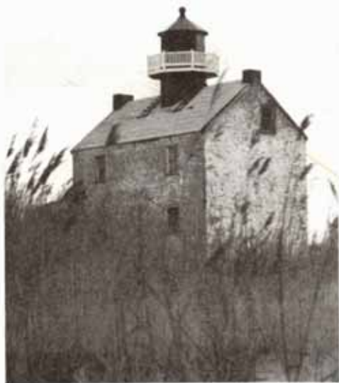
East Point Lighthouse