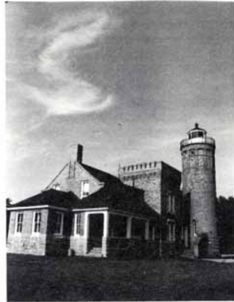
Old Mackinac Point Lighthouse

Mackinac Island State Park Commission, it is a maritime museum.