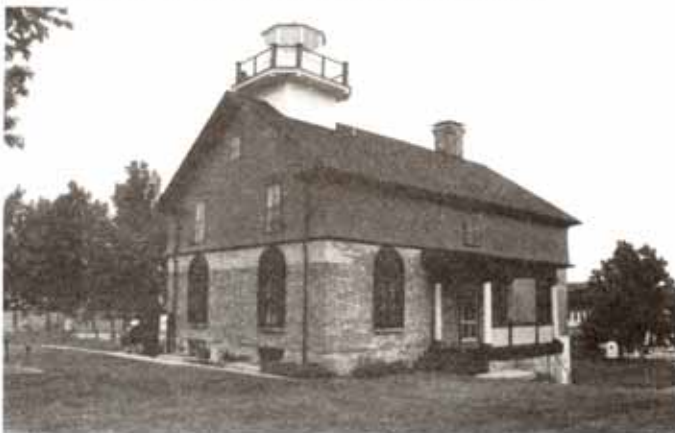
Michigan City Lighthouse

Built in 1858, it replaced an earlier wooden tower and dwelling built in 1837. According to legend, it was