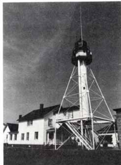
Whitefish Point Lighthouse

The original lighthouse was built of split stone, bricks and mortar and completed in late 1848. It was replaced in 1861 by the present iron tower. The lighthouse is a twin of the Detour Point lighthouse on Manitou Island. The area around Whitefish Point has long been a menace to shipping, largely due to the many dangerous shoals in the area. The Edmund Fitzgerald was lost off Whitefish Point on November 10,